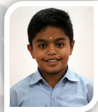
ADIT J 8 - A 3796

To conclude, i was looking for A friend like you When will this bond ever end i have no clue.